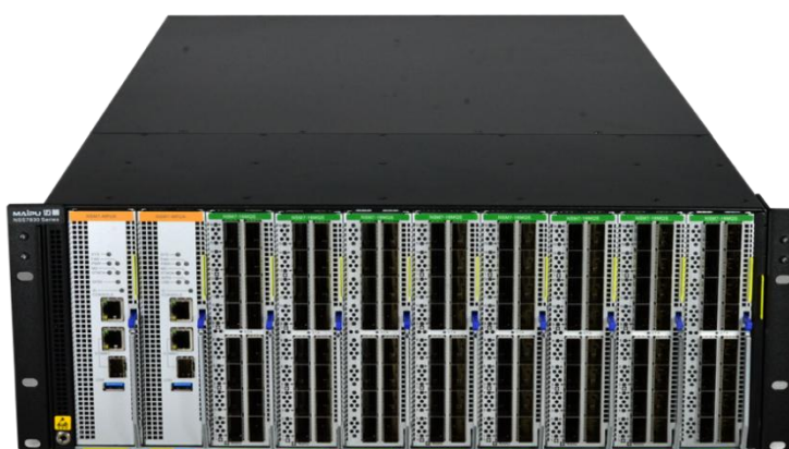
NSS7830-09C 400G Data Center Switch

NSS7830-09C supports 1*Control engine slot, 1*Multi-service slot, 8*Service slots, 4*Power slots, 5*Fan slots.