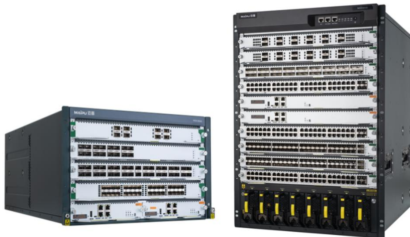
NSS18500 Series Switches

NSS18500 series includes NSS18500-04, NSS18500-08 two models: