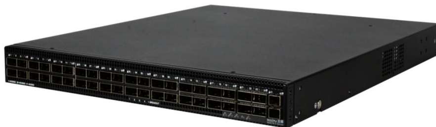
NSS7810-24QV16QE 200G Data Center Switch

NSS7810-24QV16QE supports 24*Port 200G QSFP56 interfaces, 16*Port 400G QSFP112 interfaces, 2*Port 25G SFP28 interfaces, 6*Fan slots, 2*Power slots.