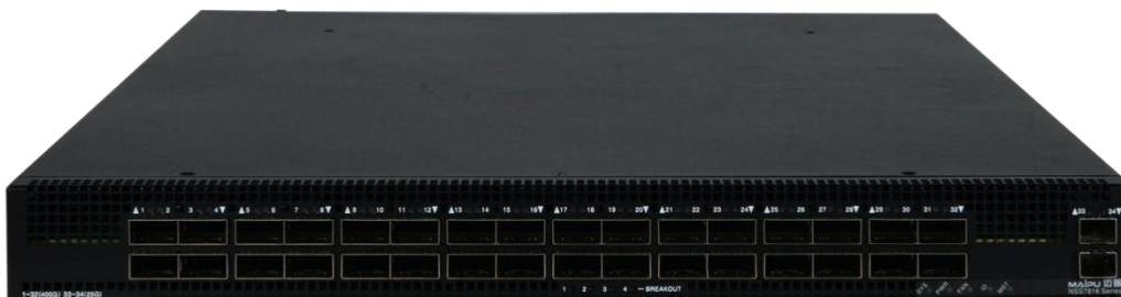
NSS7816-32QE 400G Data Center Switch

NSS7816-32QE adopts advanced hardware architecture with up to 32*400GE ports. It can work together with NSS5830/5930 VxLAN leaf switches to build a complete, scalable, virtualized fabric network that meets the data center requirements.