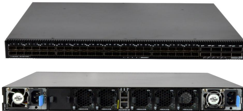
NSS5932-48FP8QS DC Switch

NSS5932 series realize large buffer of the interfaces, meeting the burst flow forwarding without packet loss, provide the M-LAG technology for virtualization scenarios, provide the modular power and fan design for high reliability. The key components adopt "overvoltage" designs to ensure that the product has the strong ability of continuous operation. NSS5932 series can work with NSS5950 & NSS18500 spine switches to build a complete, scalable, virtualized RoCEv2 fabric network that meets the data center requirements.