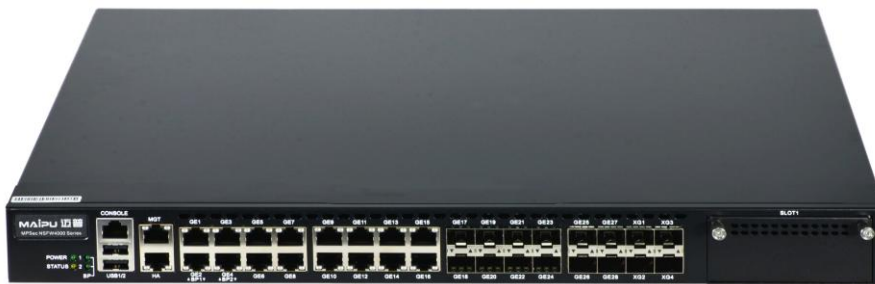
MPSec NSF4000-F5 Ultra

MPSec NSF4000-F5 Ultra is a high-performance next-generation firewall (NGFW), which can deeply analyze users, locations, traffic, applications, content, etc. in network traffic from multiple perspectives, deeply identify application-layer threats, and provide users with effective application-layer integration Security protection, protecting user borders and safe operation of business. The highly integrated multi-functional security module effectively reduces equipment stacking and simplifies user network architecture.