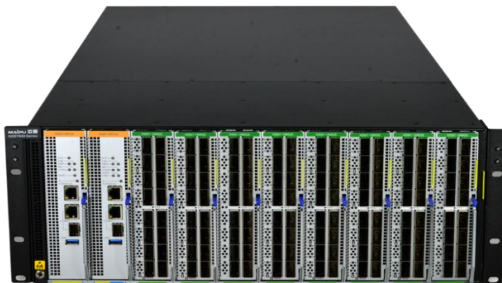
NSS7830-09C 400G Data Center Switch

NSS7830-09C supports 1*Control engine slot, 1*Multi-service slot, 8*Service slots, 4*Power slots, 5*Fan slots.